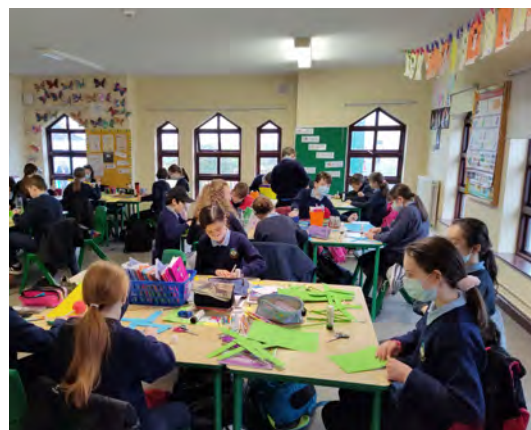
Making St. Brigid Crosses