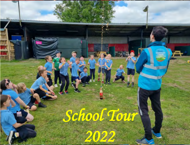
School Tour 2022