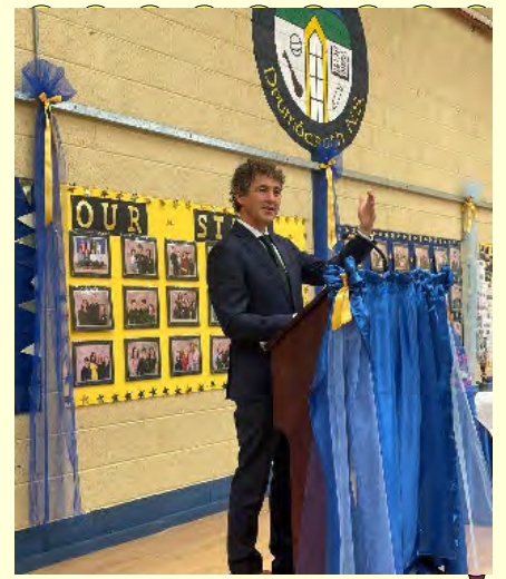
Senator Mark Daly

As part of the celebrations Senator Mark Daly visited to present the school with a certified Irish Flag in commemoration of our sesquicentennial. Senator Daly gave a wonderful presentation on the history of our national flag to senior classes and was notably impressed with the questions that followed from politically minded pupils in Drumbaragh School.