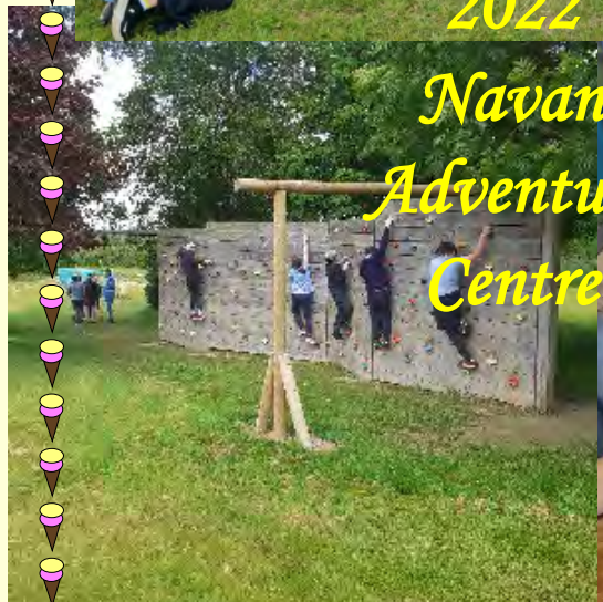
Navan Adventure Centre