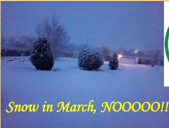
Snow in March, NOOOOO!!

Congratulations to our student council who raised three hundred and twenty euro with their Christmas Candy Cart. This money was used to purchase grow beds for our Incredible Edibles garden project. There was great excitement when our grow boxes arrived, that quickly turned to disappointment with the arrival of the snow, playing havoc with all our gardening plans!! So after Easter the Student Council will be very busy little bees planting, watering, and praying that our school garden springs to life in time to meet the competition deadline!!