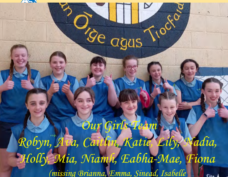
Our Girls Team

Huge congratulations and thanks to our boys and girls who participated in the recent Mini 7's Football Challenges. The weather on both occasions was unkind and opponents were tough but my pitch champions played with heart, sportsmanship and for the enjoyment of the game which is what it is all about!!!