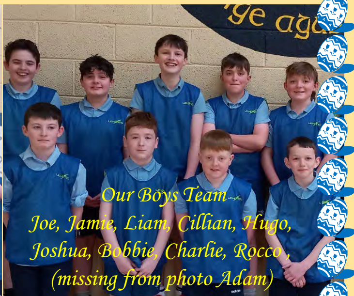
Our Boys Team