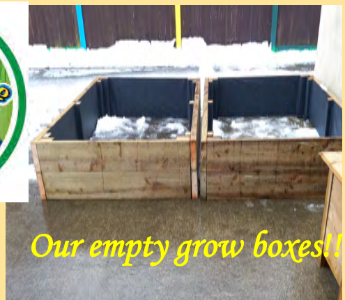
Our empty grow boxes!!!